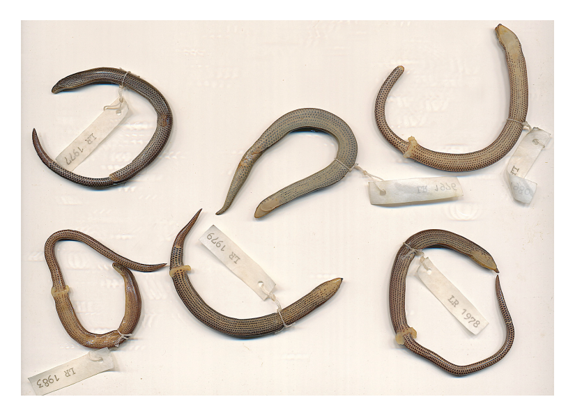
Figure 4. Ventral view of holotype and some paratypes to show variation in patterns.