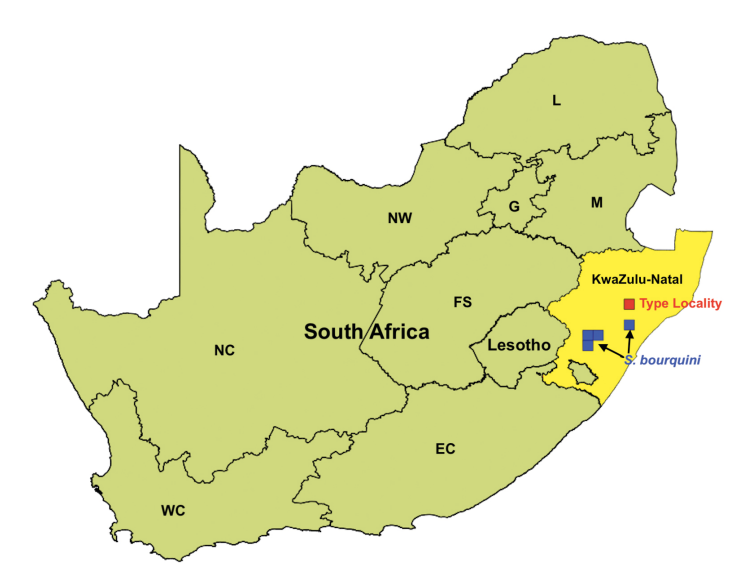
Map 1. Type locality of S. farquharsoni and known distribution S. bourquini . (Note that the Tukela (Tugela) Valley forms an impassable ecological barrier across the gap between the red square and the nearest blue square).

Habitat: Under loose rocks on a grass-covered hillside in 'Ngongoni Grassveld (Acocks, 1975: 21-23) (Fig. 5).