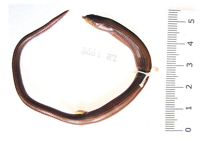
Figure 2. Dorsal view of Scelotes farquharsoni holotype LR 1978.

Pietermaritzburg and Thornville - LR 1959; Durban - LR 1964, 1966, 1970, 1982; Ingwavuma Distr. - LR 955; Ubombo - LR 433-4, 1950, 1953-4, 1958, 1960.