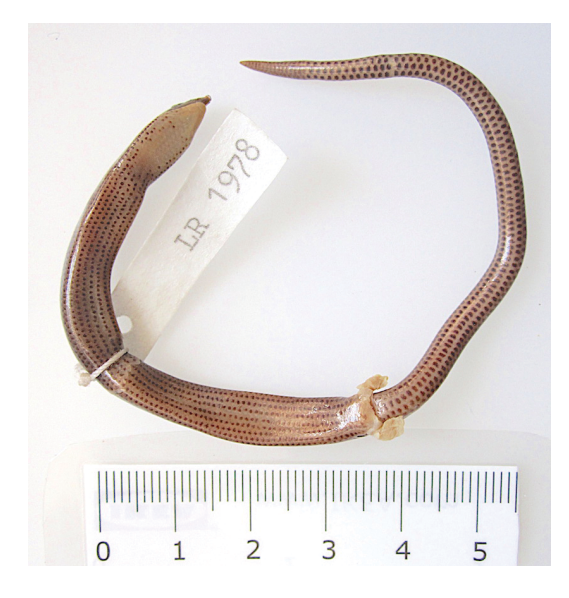
Figure 3. Ventral view of Scelotes farquharsoni holotype LR 1978.